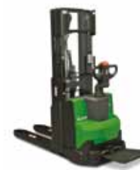
S212L - 214L