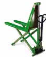
CE100HL - 100HLE