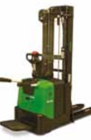
S313L - 316L - 320L