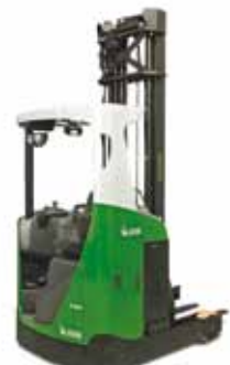
R314 - R316 - R318 - R320 - R325