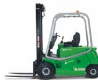
Blitz 250 - 300 - 300L - 350