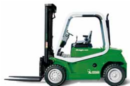
Drago 400 - 450 - 500