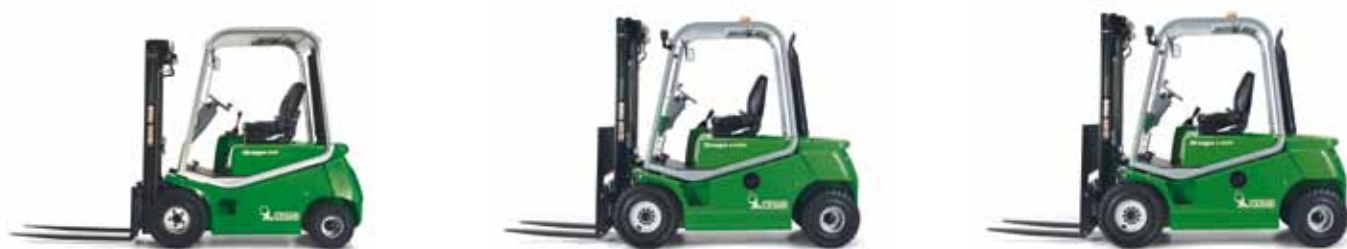
Drago 150 - 180 - 200